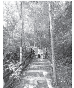
Information Bulletin HAMAMATSU September 2025 Cover

*This bulletin contains selected information from the Japanese edition published by City Hall. *The telephone numbers listed in this bulletin will all be answered in Japanese only.