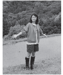
Information Bulletin HAMAMATSU July 2023 Cover