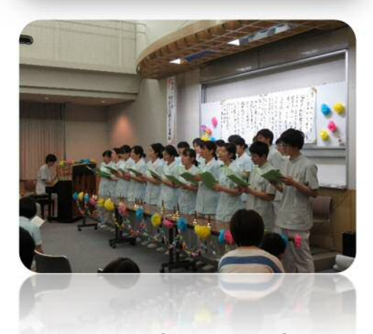
HMNC students visit hospitals and encourage patients with music and caring spirit.