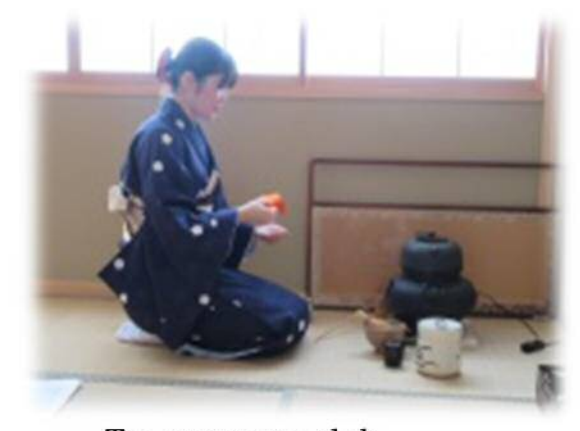
Tea ceremony club