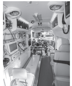
Information Bulletin HAMAMATSU December 2025 Cover

*This bulletin contains selected information from the Japanese edition published by City Hall. *The telephone numbers listed in this bulletin will all be answered in Japanese only.