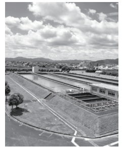
Information Bulletin HAMAMATSU August 2025 Cover

*This bulletin contains selected information from the Japanese edition published by City Hall. *The telephone numbers listed in this bulletin will all be answered in Japanese only.