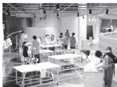
Experiment and craft workshops are offered in the Mirai-ra Room!