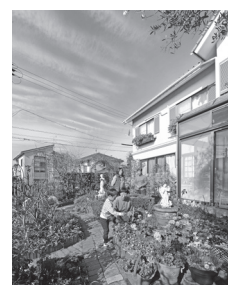
Information Bulletin HAMAMATSU March 2025 Cover

*This bulletin contains selected information from the Japanese edition published by City Hall. *The telephone numbers listed in this bulletin will all be answered in Japanese only.