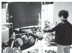
A new "Weird Instruments" exhibit has opened for playing with sounds and shapes!

First-phase renovations will be opened to the public on March 20. Our intention is for the museum to provide a place of interaction, where a variety of individual and collective learning experiences can be enjoyed at will.