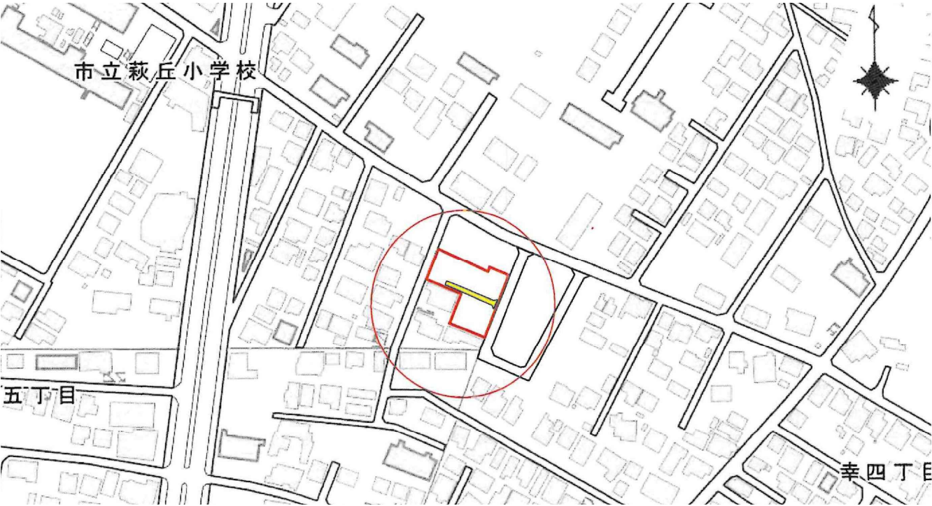
公図写 縮尺: 1/600