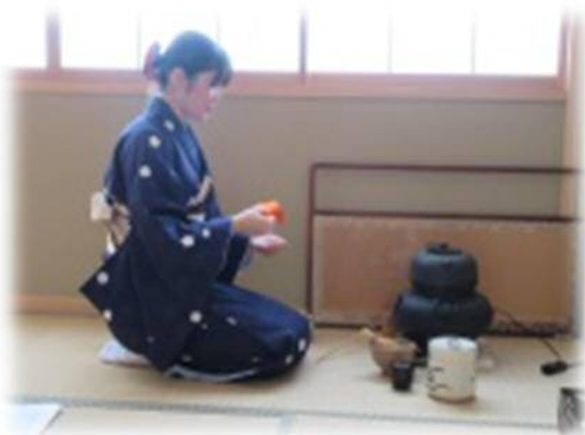
Tea ceremony club